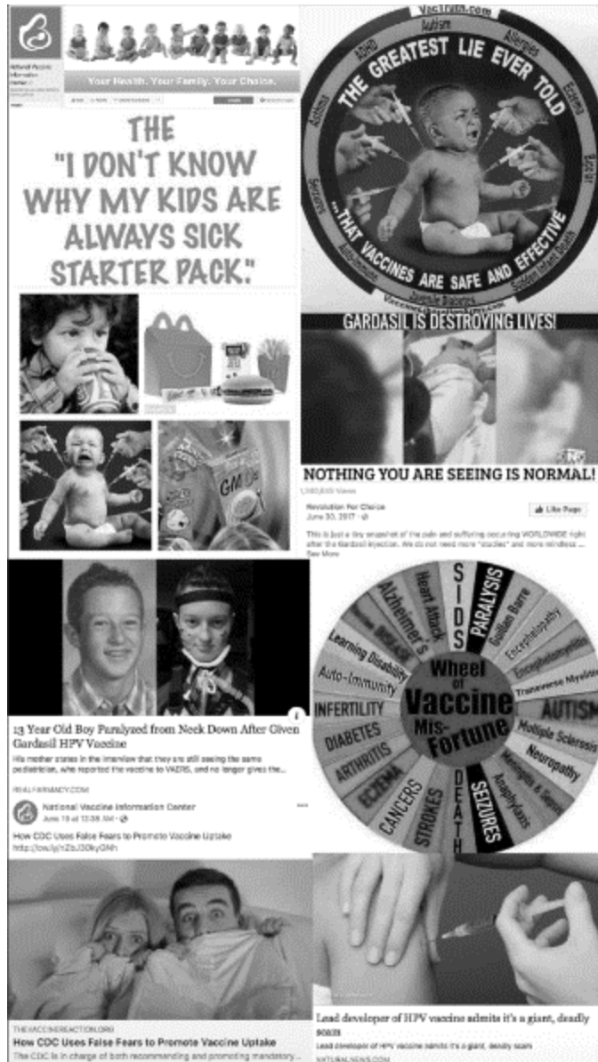
Figure 2 Frequent anti-vaccination posts on Facebook profiles and in anti-vaccination groups on Facebook.